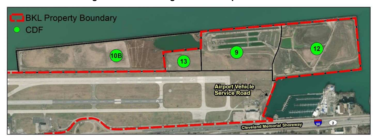
Figure 1-1. Existing Confined Disposal Facilities

currently operates the northern half of CDF 9 and all of CDF 12. The U.S. Army of Engineers (USACE), Buffalo District operates and maintains CDF 10B, and CDF 13 is closed.